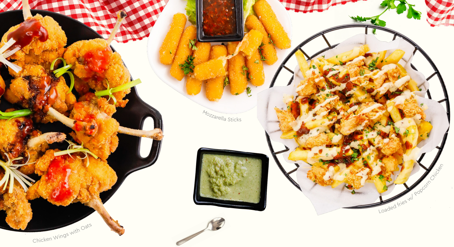
Chicken Wings with Oats